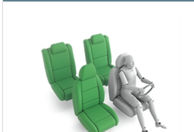
Maxi Cosi Cabriofix & EasyBase2 (Belt)