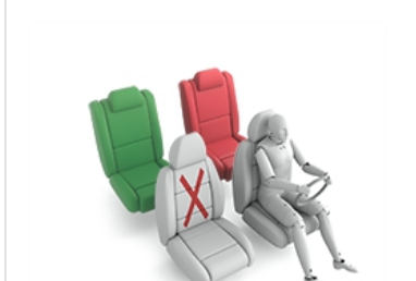
BeSafe iZi Kid X4 ISOfix (ISOFIX)