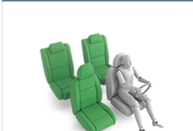
Maxi Cosi Cabriofix (Belt)