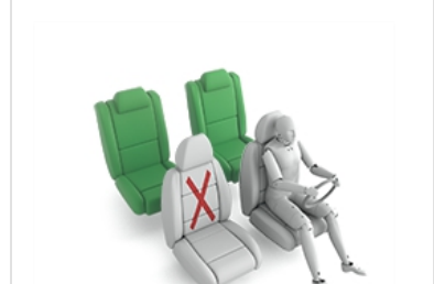
Britax Römer Duo Plus (ISOFIX)