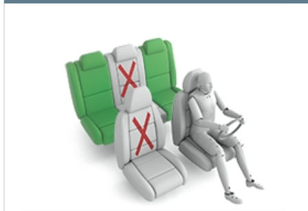
BeSafe iZi Kid X4 ISOfix (ISOFIX)