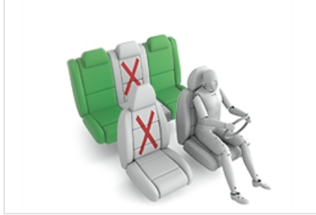
Maxi Cosi 2way Pearl & 2wayFix (forward) (iSize)