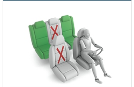
Britax Römer Duo Plus (ISOFIX)