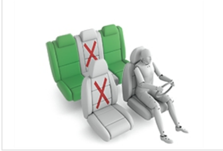
Maxi Cosi 2way Pearl & 2wayFix (forward) (iSize)